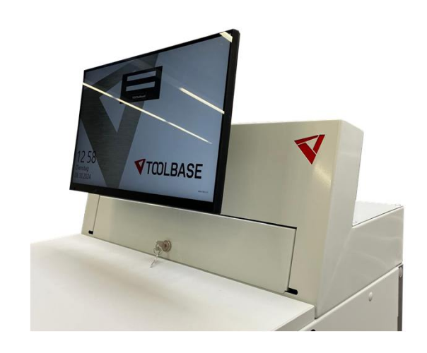
Control Top EL-12